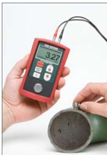
Wall thickness measurement on a tube using the miniature probe