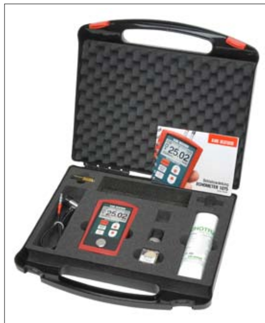
Delivery in a handy carrying case