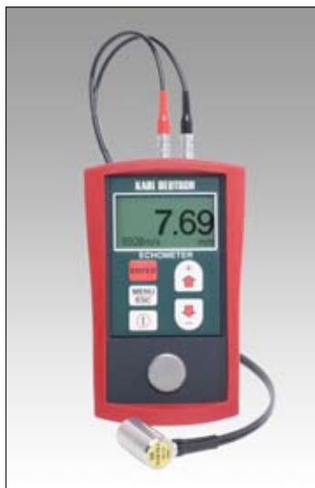
Large clear graphic display with bright background illumination