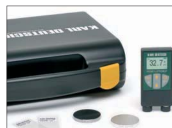
Pocket-LEPTOSKOP with accessories

KARL DEUTSCH Prüf- und Messgerätebau GmbH + Co KG Otto-Hausmann-Ring 101 · 42115 Wuppertal · Germany Phone (+49 -202) 7192-0 · Fax (+49 -202) 714932 info@karldeutsch.de · www.karldeutsch.de