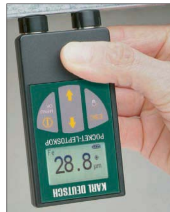
Flip display: easy to read even when measuring overhead

Pocket-LEPTOSKOP 2018 NFe – for measurements of colour, lacquer, plastic, rubber, ceramic, insulation and galvanic coating on all non-magnetic metals like aluminium, copper, brass or certain high-grade steel (eddy current method – DIN EN ISO 2360)