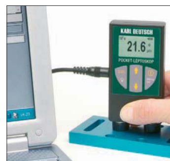
Serial PC interface