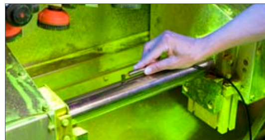
Example on application: Measurement of tangential field by means of the 90°-probe at field flow

For optimal adaptation to the geometrical conditions you can choose between a 0° and a 90°