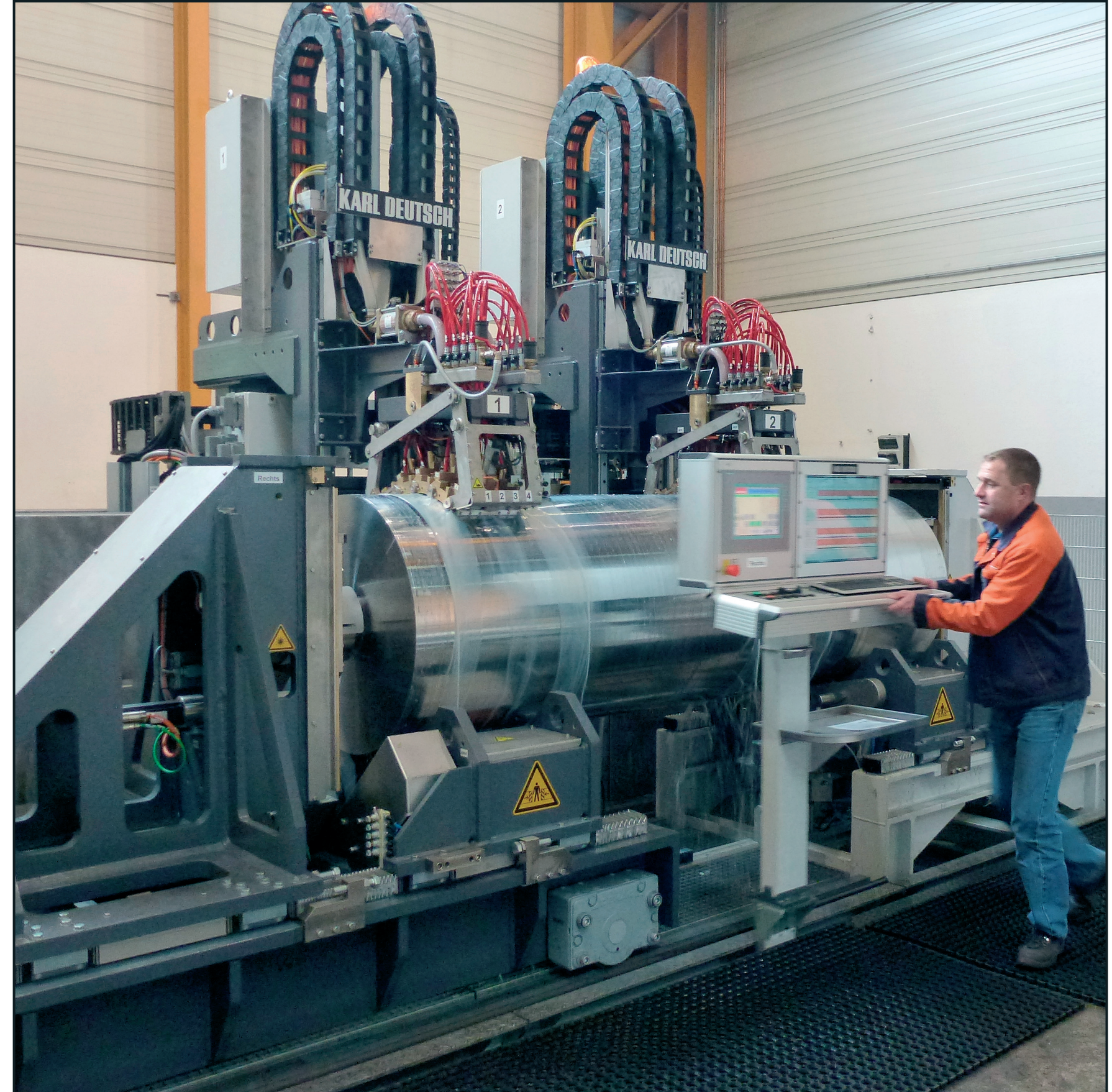
Rotational Testing of Round Forgings with Two Probe Holders