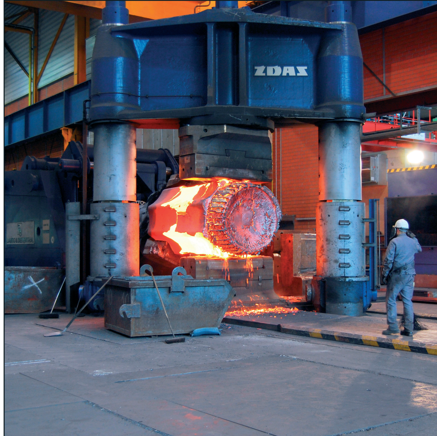
New Forging Press at BGH Siegen Edelstahl GmbH in Siegen, Germany