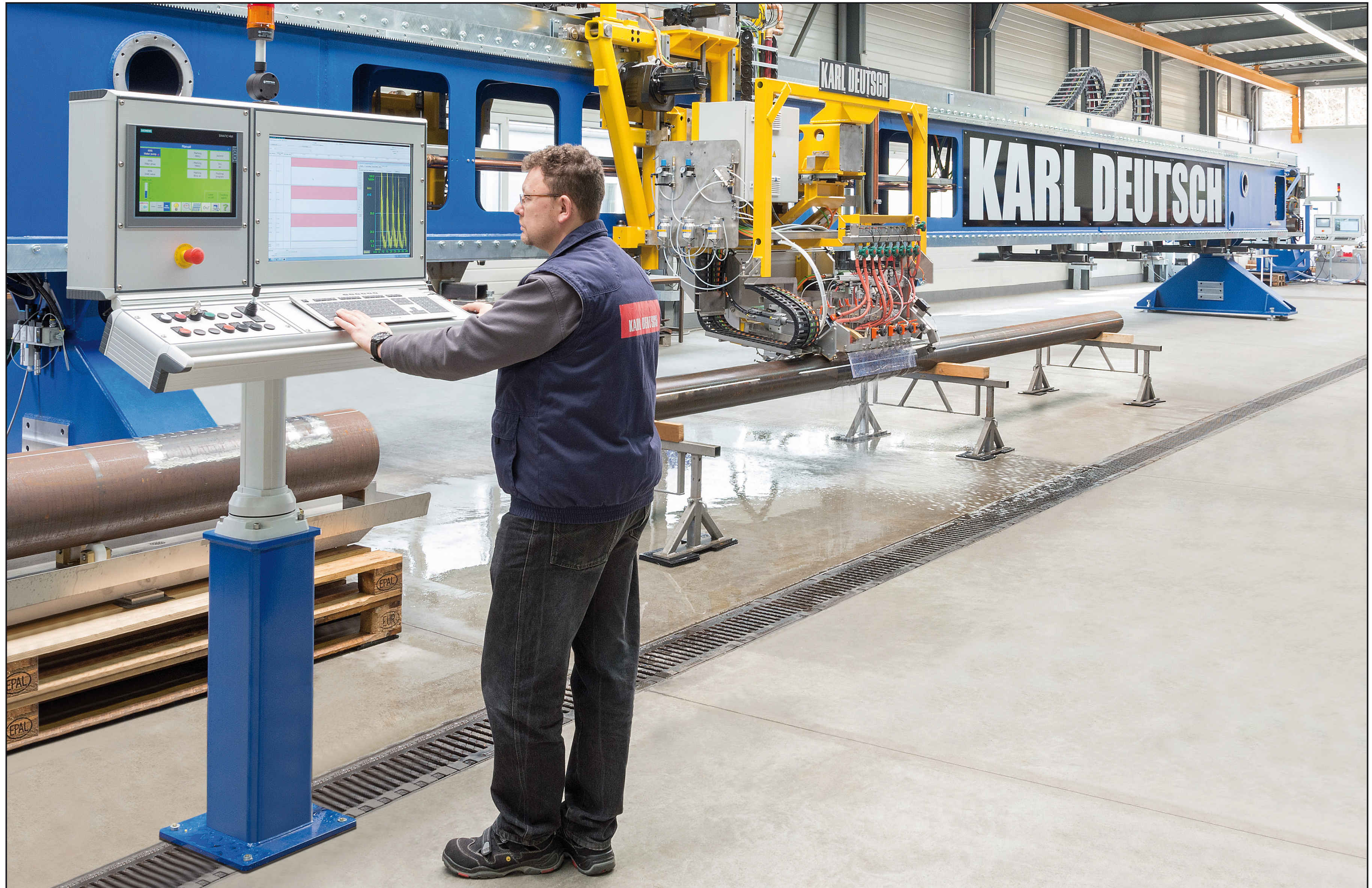
Free-Standing Testing Bridge with a Length of 35 m for Offline Weld Testing (Front Side) and Rotational Full-Body Testing (Rear Side)