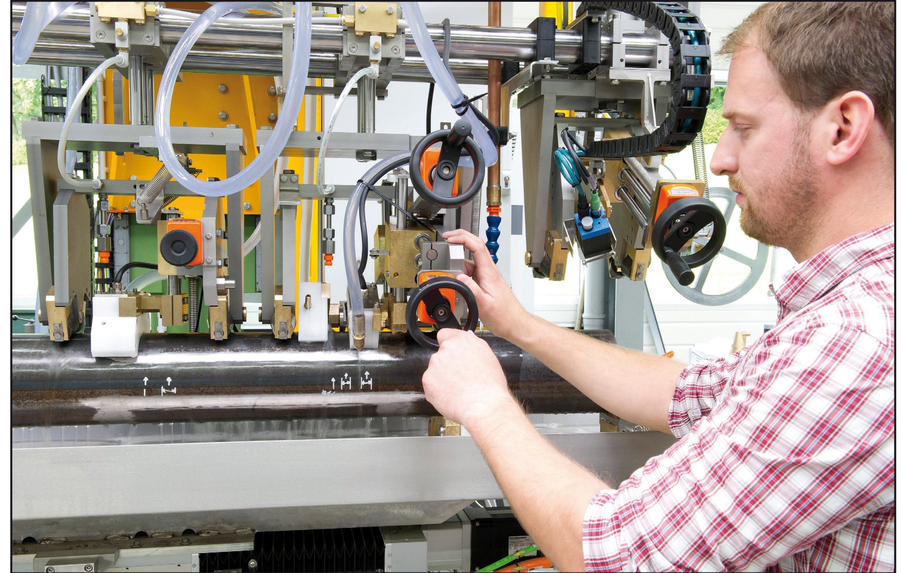
Online Weld Testing with 3 Phased Array Probes and 320 Channels