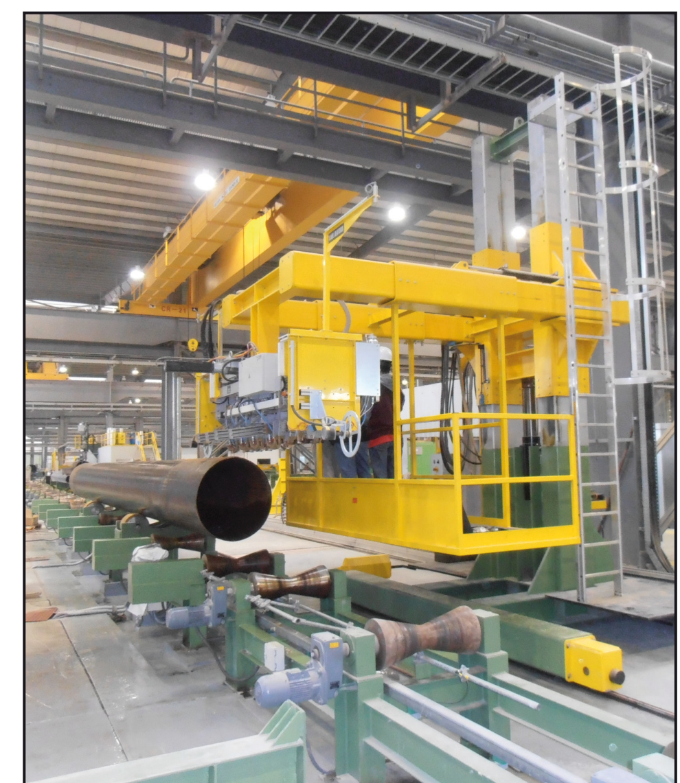
Weld Testing System @ Global Pipe