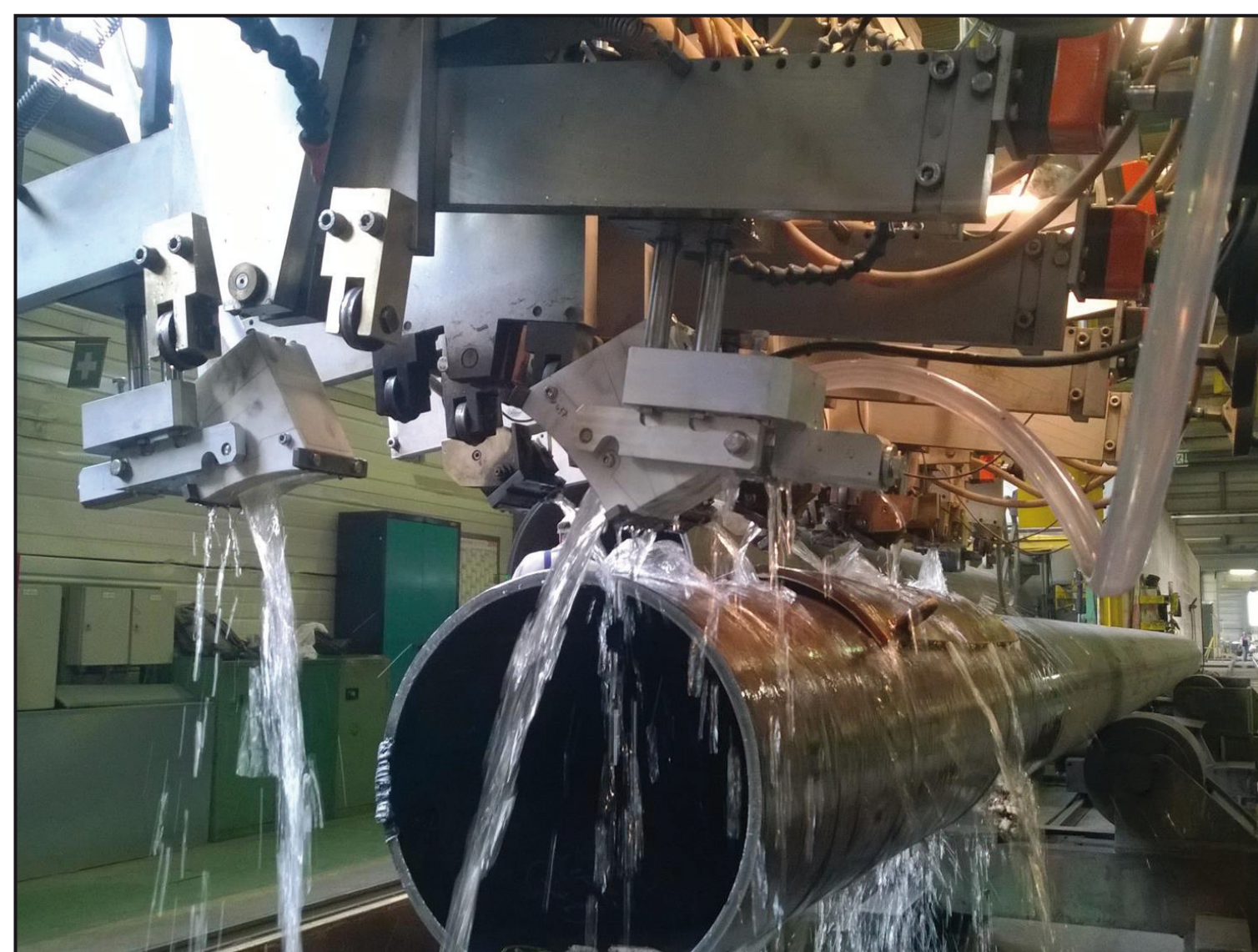
Phased Array Probes for Longitudinal Defects @ EEW-Germany