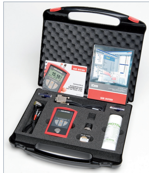
Delivery in a handy carrying case