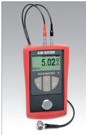
Large, clear graphic display with bright background illumination