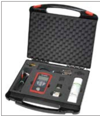
Delivery in a handy carrying case