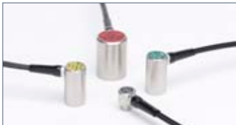
For any measurement: The probes of the ECHOMETER 1076 TC