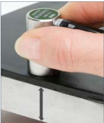
Measurement also through coatings