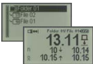
Very easy, clearly arranged and user-friendly data handling and measured value display