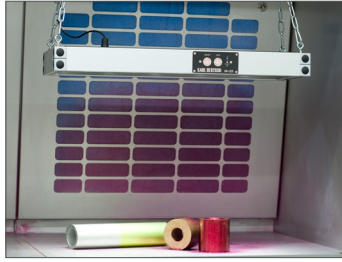
UV LED large area lamp 3846.001 in KD-Check stationary system with white light